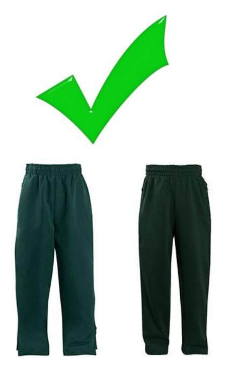
ONLY BOTTLE GREEN TROUSERS OR TRACKSUIT PANTS