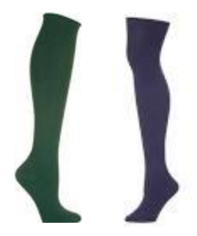
ONLY BOTTLE GREEN OR NAVY STOCKINGS OR TIGHTS