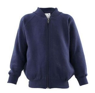
ONLY NAVY BLUE PLAIN JUMPERS. You can purchase a school logo sew-on badge at uniform shop.