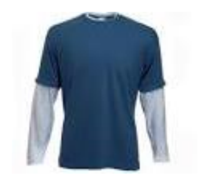
NO long sleeve shirts under school shirts