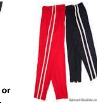
NO coloured tracksuit pants or trousers besides BOTTLE GREEN