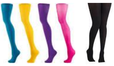
NO coloured or patterned stockings or tights. NO black tights or stockings.